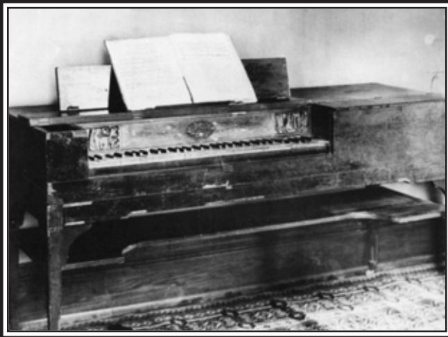
LUCY ANN CLARK'S PIANO, NOW PART OF THE UM STEARNS COLLECTION.