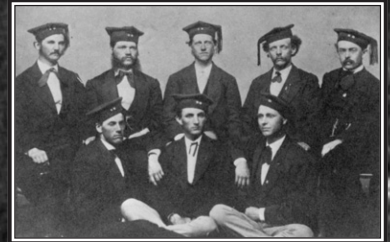
FOUNDED IN 1859, THE UM MEN'S GLEE CLUB WAS RUN BY STUDENTS WHO LOVED TO SING.