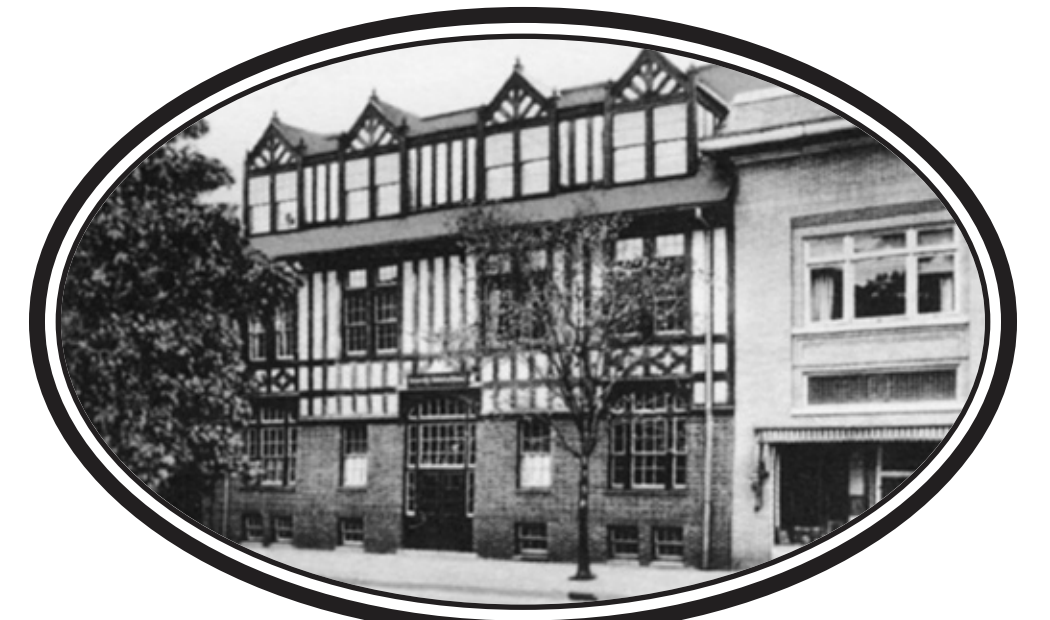
THE SCHOOL OF MUSIC, ON MAYNARD NEXT TO THE NICKELS ARCADE, WAS REMODELED IN 1916.