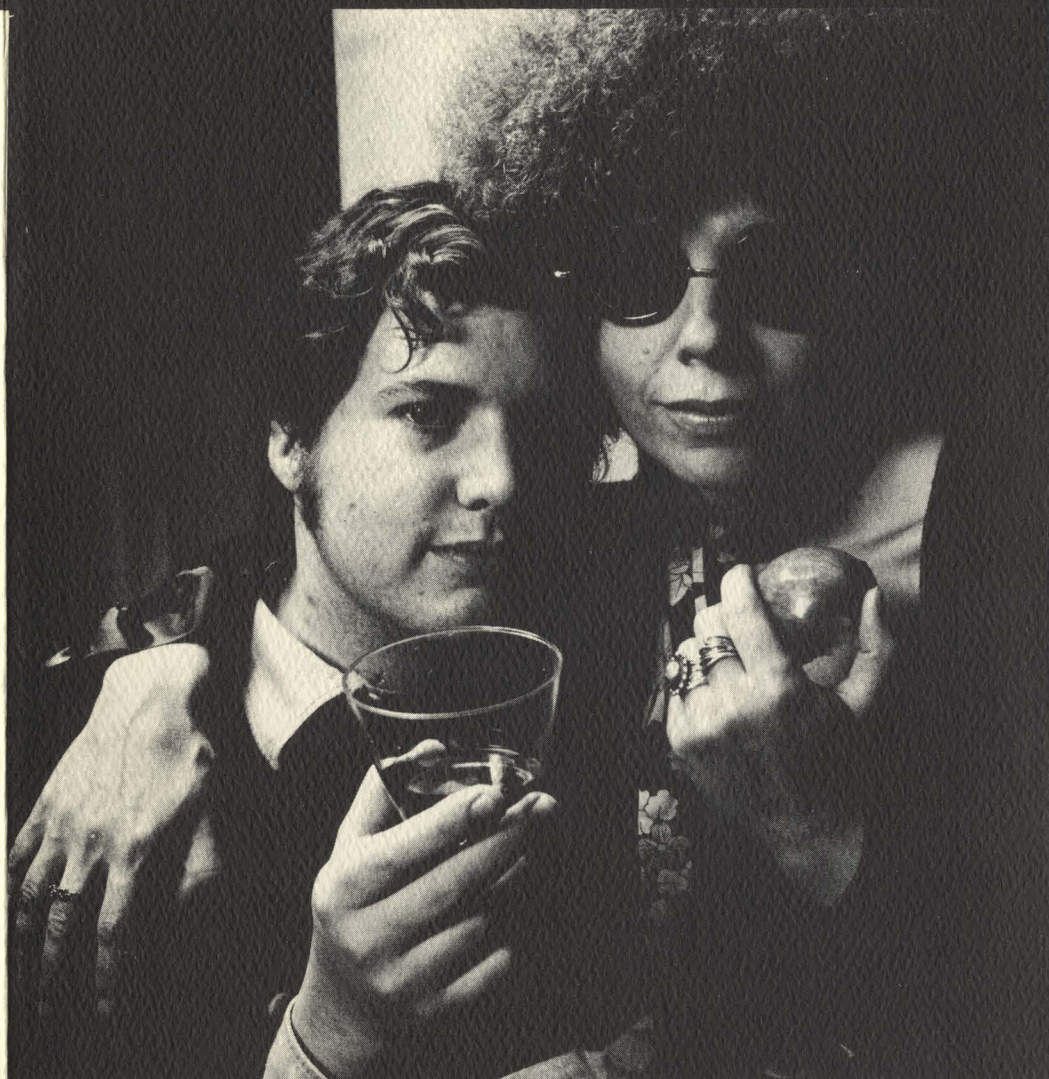
Harry Mutual and Longshot in SAY IT ISN'T SO

All films submitted to the festival, except those sent on tour, are returned immediately following the festival—post-paid and insured. Films sent on tour are returned in the same way following the last tour date.